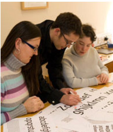
Going To College