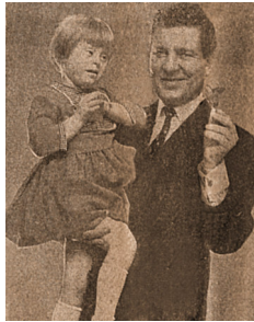
The broadcaster Richard Baker at the opening of Parkside in 1963

Parkside is a registered charity based in Aldershot that provides support services for children and adults with learning disabilities living in the local area, covering both Hampshire and Surrey. It was founded in 1963 by a group of parents who realised that the support for families who had children with special needs was limited. The premises next to the park on the Guildford Road was built, and the first playgroup was started (affectionately known as the Peter Pan Club). Since then, Parkside has strived to fulfil the need for more services and has gone from strength to strength.