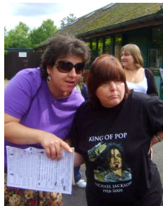
The PIP group enjoy a day out at Birdworld

Parkside's aim as a charity is to give both children and adults the opportunity to develop their individual skills and to take part in activities within the local community. Needs can vary from requiring support to socialise with friends, to participating in leisure activities, meeting new people, to developing life skills and providing respite for other family members. By reaching out into the community, Parkside aims to develop and strengthen its links with local people and organisations, creating opportunities for everyone to become involved and included.